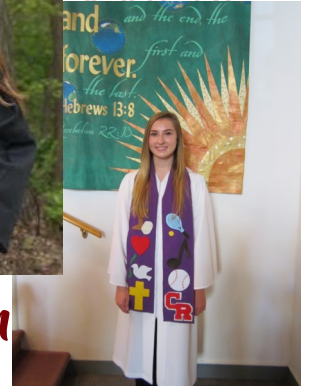
College: University of Minnesota Degree: Biomedical Engineering