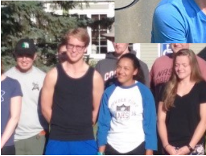
College: Wartburg College Degree: Neuroscience