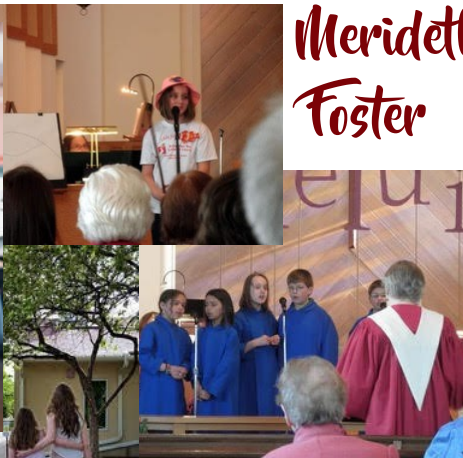
College: Gustavus Adolphus College