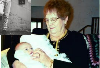
College: South Dakota State University