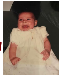
College: South West State