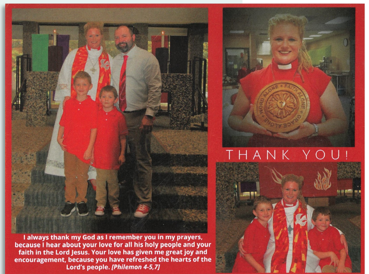
I always thank my God as I remember you in my prayers, because I hear about your love for all his holy people and your faith in the Lord Jesus. Your love has given me great joy and encouragement, because you have refreshed the hearts of the Lord's people. [Philemon 4-5,7]