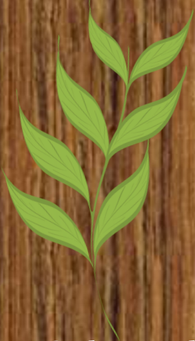
God created the world - and we can be creative too!