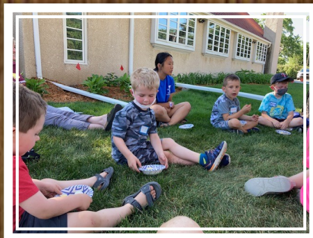
Bible story time was very good!

“God saw everything that He had made, and indeed, it was very good!” - Genesis 1:31