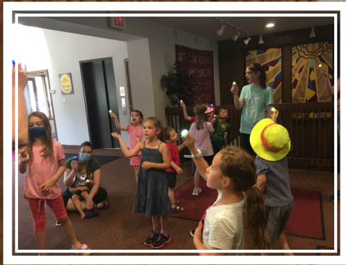
Learning Bible songs was very good!