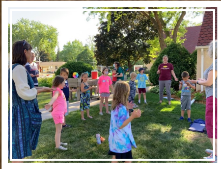
Playing games was very good!